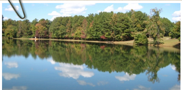
Enjoy the natural beauty of Woodland Christian Camp.